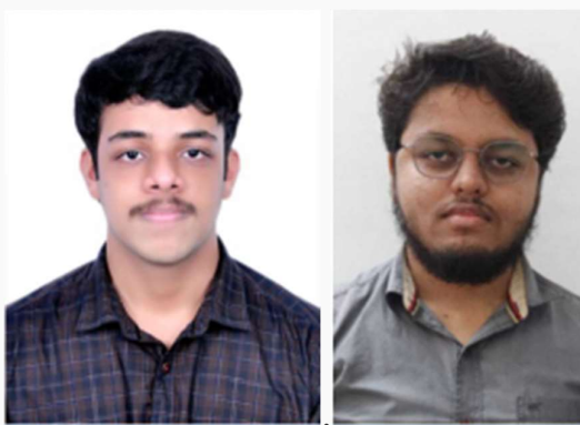
IIT Bombay Racing Team Brings Home the Title

The Royal Microscopical Society, Oxford, UK, holds image (Transmission electron and Scanning Electron Microscope) competition globally once in two years.